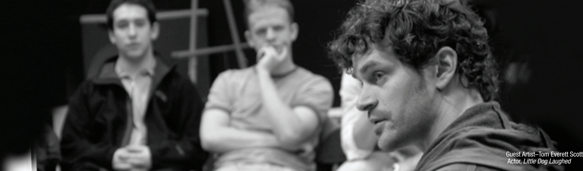
Guest Artist—Tom Everett Scott Actor, Little Dog Laughed